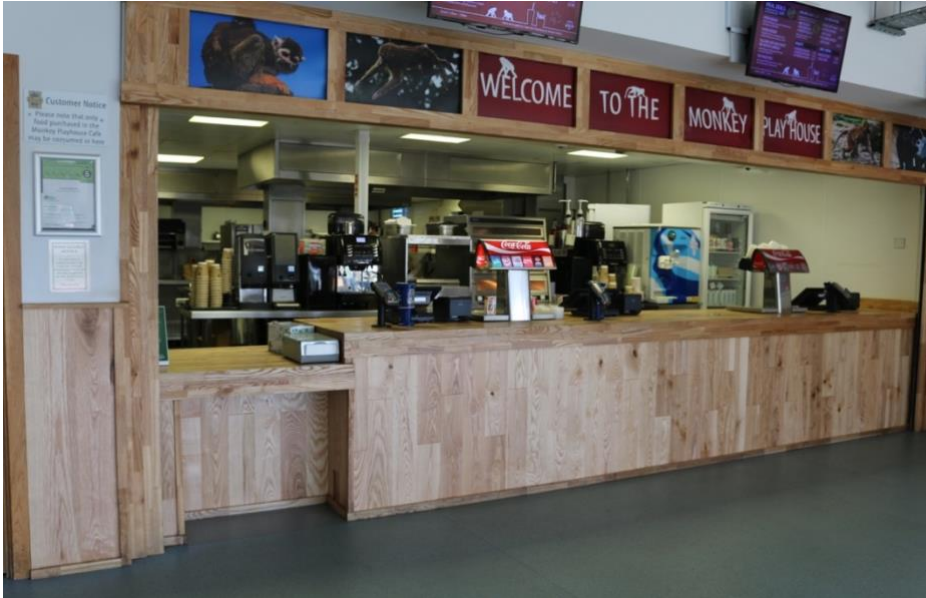
Lowered counter in Monkey Playhouse eatery