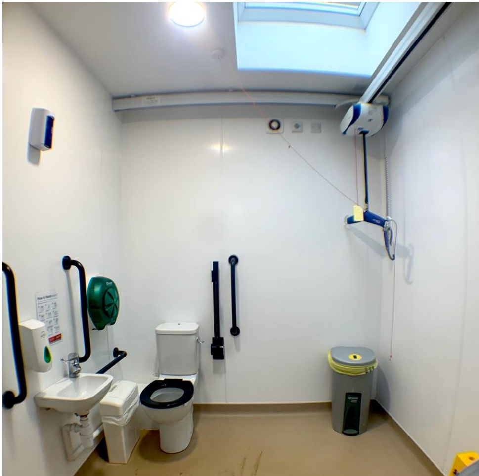
Masai Accessible toilet and hoist