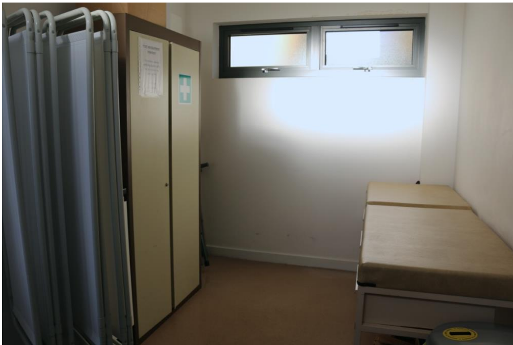
First Aid room