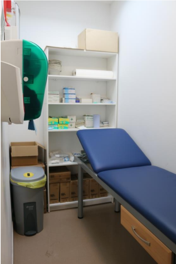
First Aid Room, Masai Coffee House.

There are trained First Aiders on site to help with Emergency situations. First Aid rooms are located at the entrance of the park, Masai Coffee House and near the Meerkat reserve.