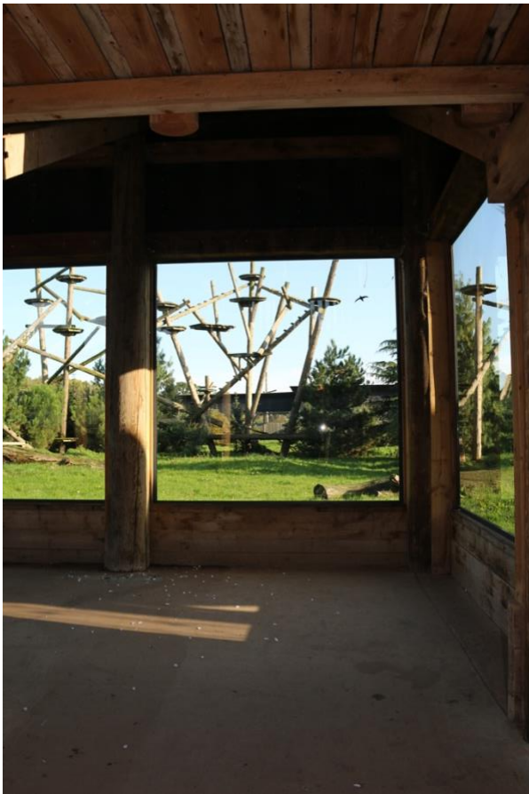
Glass viewing panels- Leopard Heights