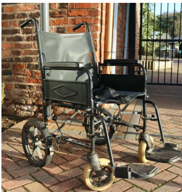
Manual transit wheelchair