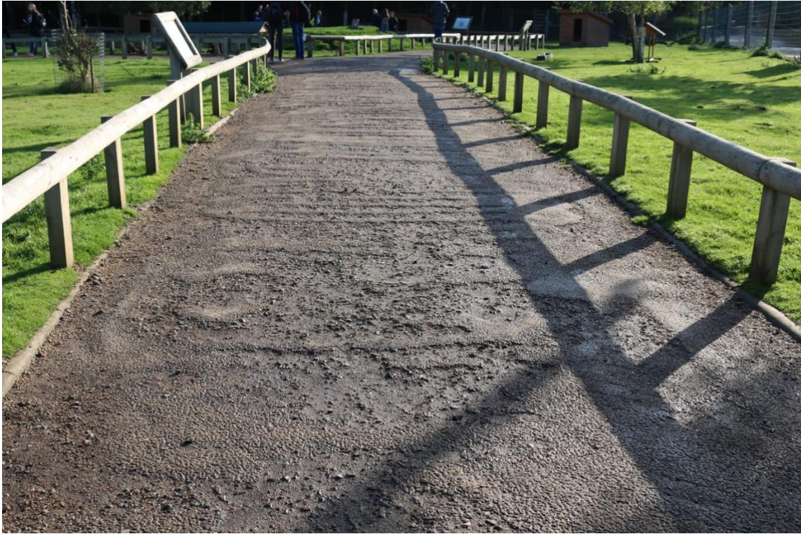
Wallaby walkabout path