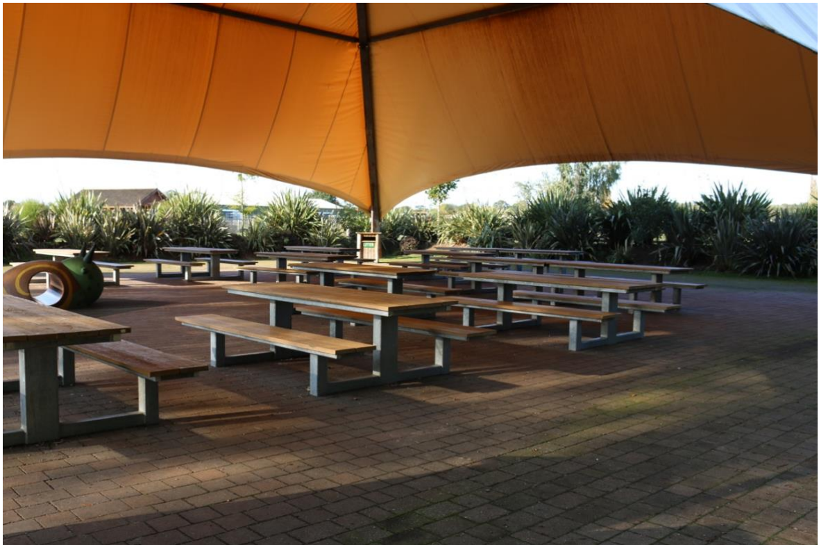
Pyramid tent play area picnic benches

If you have any special dietary requirements, see our website for Allergens Information https://www.yorkshirewildlifepark.com/plan-your-visit/where-to-eat/