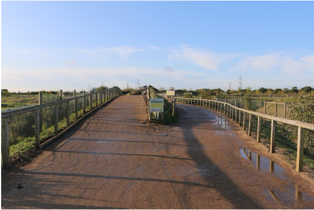
Path to Lion Country with slight incline