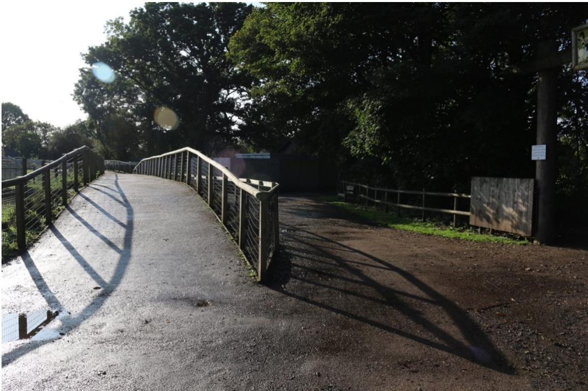
Path to Giant Otters