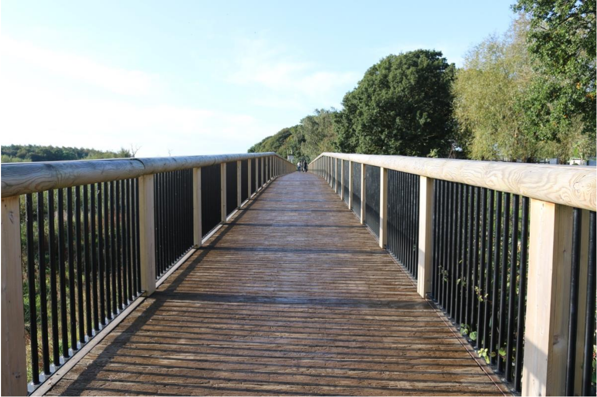
Path to Land of the Tigers and Okapi