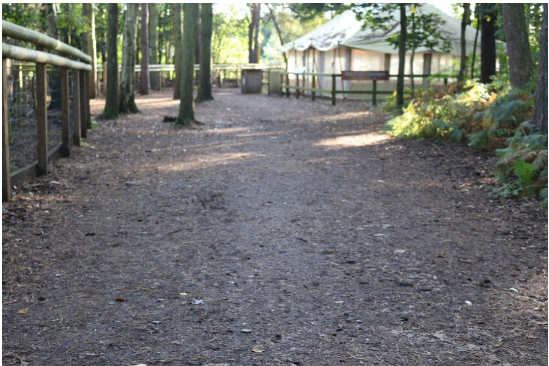
Woodland area (Warty pigs) footpath