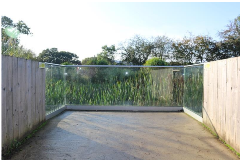
Glass viewing panel- Giant Anteaters