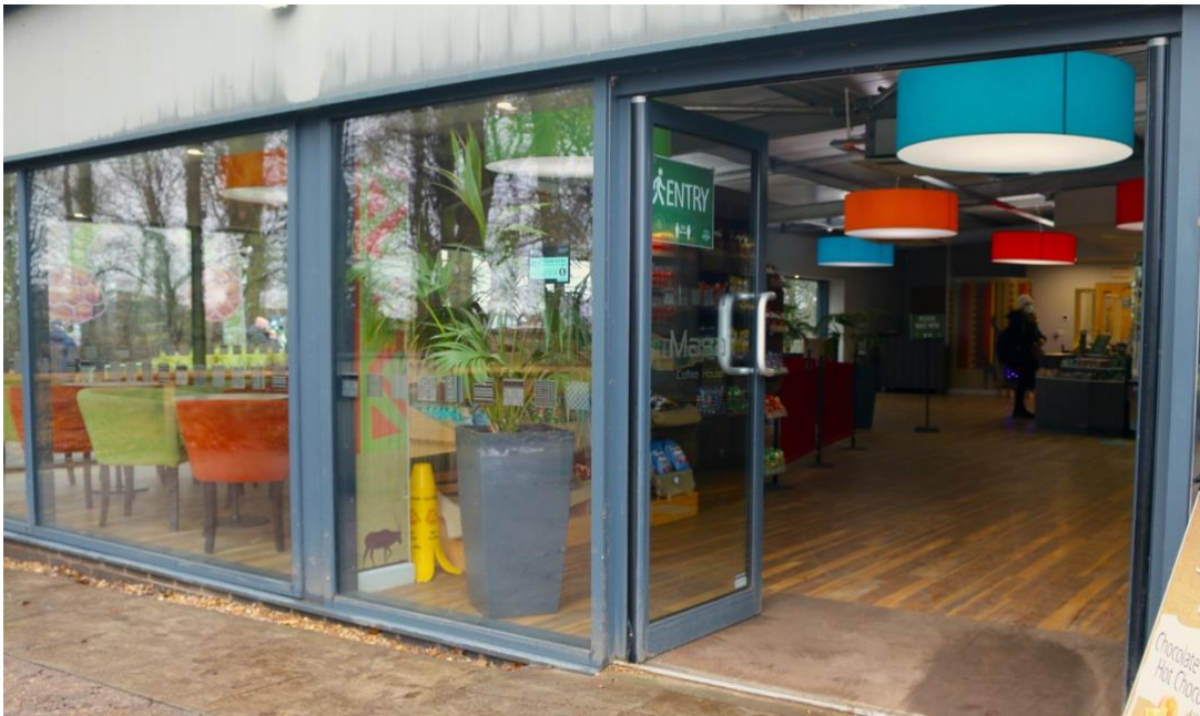
Double door entrance-Masai Coffee house