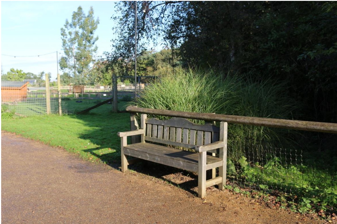
Bench rest area