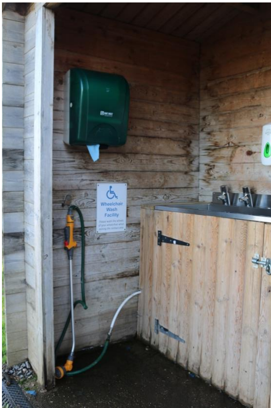
Wheelchair wash station